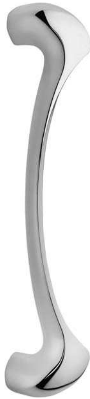
COD. 691 MN 300