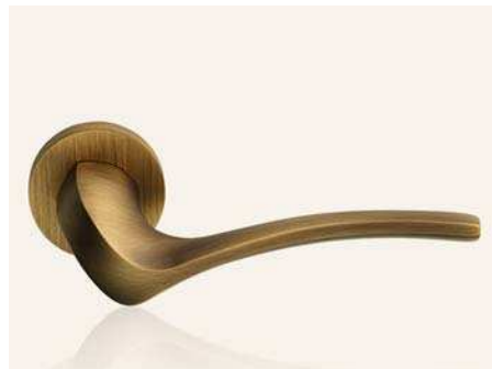
PM patiné patiné mat