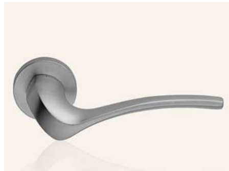
CS cromo satinato satin chrome