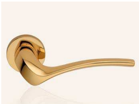
OZ oro zecchino gold plated