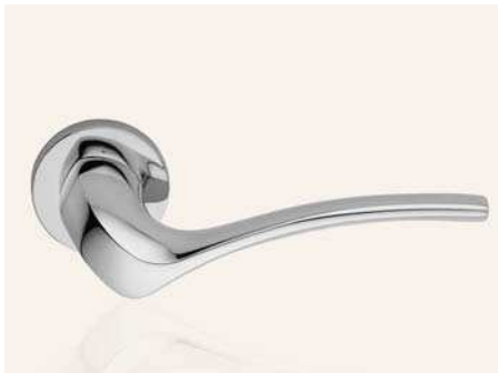
CR cromo lucido polished chrome