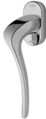
COD. 691 SK