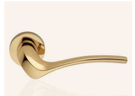
OL ottone lucido verniciato polished brass