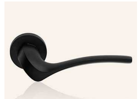
VE nero opaco matt black